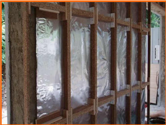
Illustration: Polynum installed in masonry walls: